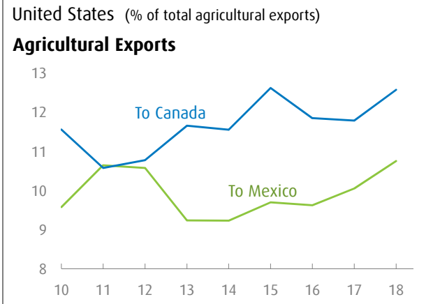
Chart 2 Hey, Big Spenders

Sources: BMO Economics, Office of Trade and Economic Analysis